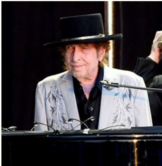
Dylan, 2019

In fall 2020, Dylan plans to open Heaven’s Door Distillery and Center for the Art , a new home for his line of signature whiskeys and artwork. In addition to the restaurant and performance venue, the space is intended to be a permanent home for his paintings and sculptures .