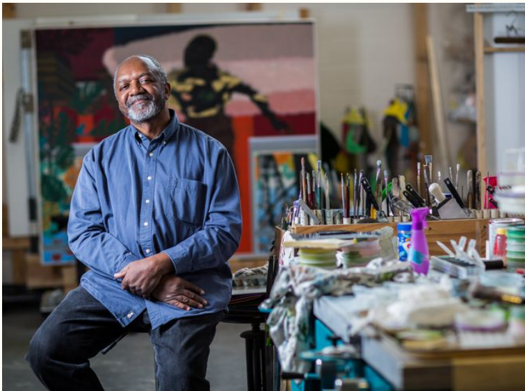
Marshall in Chicago studio, 2016

“You’re not just making artworks for yourself,” Marshall told Art21 in a 2014 interview about history, racial segregation, politics, and being a black artist in an historically white system. “You’re making artworks because they fit into a narrative structure that purports to define what kinds of things have value.”