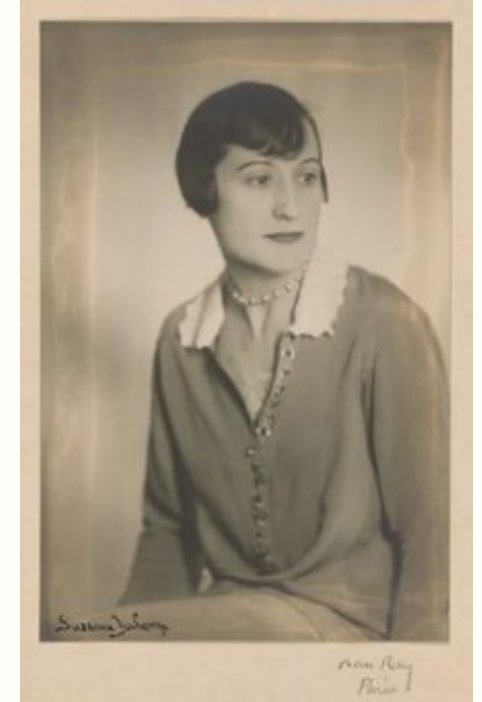
Duchamp, 1926