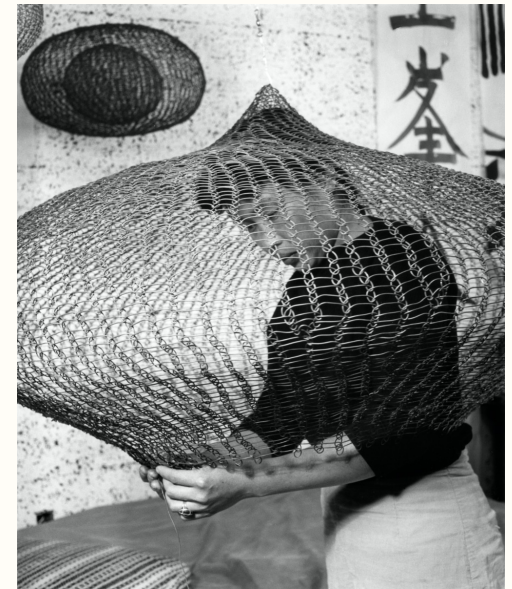
Asawa, 1957

In 2021, Modern Art Oxford will become the first public institution in Europe to host a solo exhibition of Asawa's work, exploring her self-given title as a "citizen of the world," her conviction that art could have a higher purpose in the world, and being an artist was just one facet of a happy existence, which also included having a family, participating in her communities, and being socially engaged.