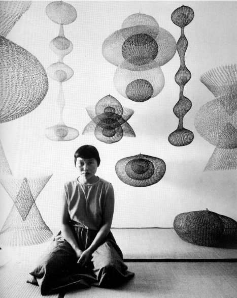
Asawa, 1954

David Zwirner Gallery in New York celebrated their new status as representatives of Asawa's estate in 2017 with a solo exhibition exploring the artist's talent in painting and drawing alongside seminal sculptures. In early 2020, the gallery's London space celebrated Asawa's first major gallery exhibition outside the United States, Ruth Asawa: A Line Can Go Anywhere .