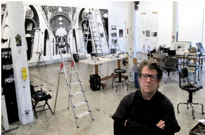
Longo in his New York studio, 2011

Musée Magazine interviewed Longo in 2016 about the themes of scientific progress, violence, and beauty in his work, and the value of influence and reproduction.