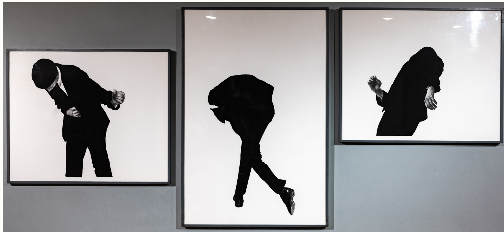
Robert Longo (American, b. 1953) Men in the Cities , 1979-80 Charcoal and graphite on paper

Private Collection, Los Angeles; L2019:160.3