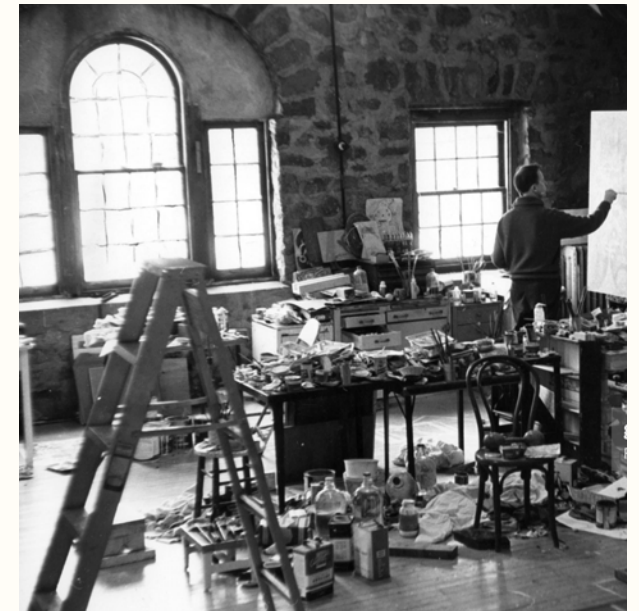
Pousette-Dart in his studio, 1962

Cambridge University’s Kettle’s Yard museum honored Pousette-Dart with his first solo exhibition in the UK in 2018, focusing on the early years of his career through sculpture and works on paper, and his development as an abstract painter in the 1940s.