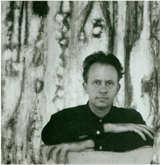
Pousette-Dart, ca. 1958