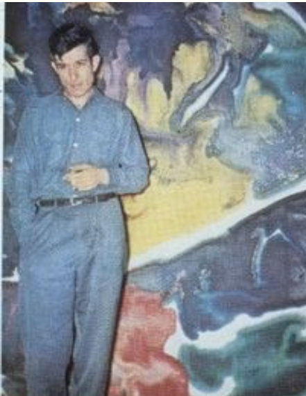
Louis, ca. 1960