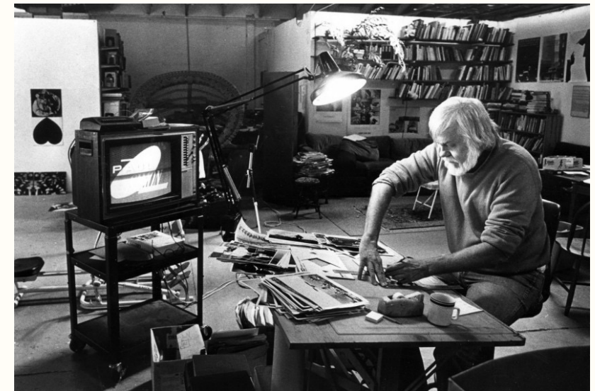
Baldessari in Santa Monica studio, 1986

In 1970, Baldessari embarked on Cremation Project , in which he burned his entire creative output until that point, 13 years of work. Discussing the project with the Tate in 2009, he remembers feeling like he “was drowning, inundated by paintings. I was getting more and more doubtful that only painting was art. The fun of it was doing it, and I thought I don’t really have to own these things, nobody’s ever going to buy them.... Then I thought about the idea of my work as a cycle – an eternal return – so all these materials, pigments and canvas that came out of the ground would return to it. It was a body of work, and I said what if these works are me, and so I’ll cremate them literally as a body.”