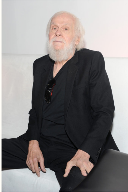
Baldessari, 2015