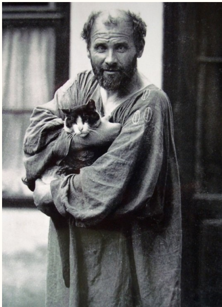
Klimt, ca. 1902

The Leopold museum celebrated the centennial of Klimt’s death and his contribution to Viennese modernism in a comprehensive survey in 2018.