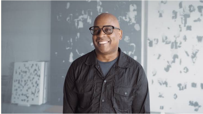
Ligon, 2018

In 1996, Glenn Ligon: New Work was on display at the San Francisco Museum of Modern Art. Glenn Ligon: Unbecoming was on display two years later at the Institute of Contemporary Art Philadelphia, tracing his career to that date and featuring some of his iconic work such as the “I AM A MAN” painting.