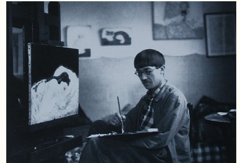
Foujita in his studio, 1917