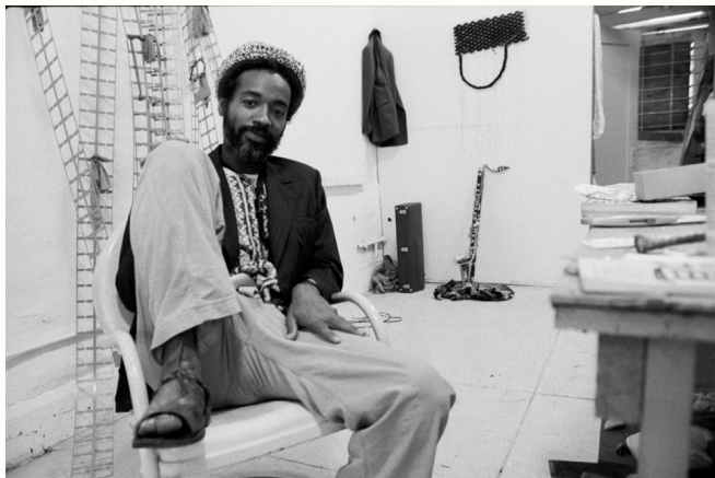
Hammons in his Los Angeles studio, 1977

Hauser & Wirth installed a solo exhibition in Los Angeles in 2019. This was the first exhibition of the artist’s work in over 45 years in the city where Hammons attended art school and lived in the 1960s and 1970s. Read an homage to the artist in Cultured Magazine and an Artnet article discussing the on-site homeless encampment in the exhibition space.