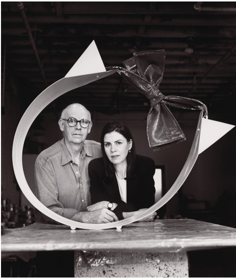
Oldenburg and Coosje van Bruggen (1942-2009) in their studio with Standing Collar with Bow Tie (1992), 1992

Claes Oldenburg: The Sixties brought together 300 pieces of Oldenburg’s early Pop Art works at the Walker Art Center . Watch Oldenburg’s Opening-Day Talk from 2013.