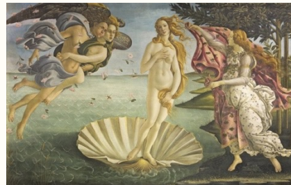
Sandro Botticelli (Italian, 1445-1510) Birth of Venus , ca. 1485 Tempera on canvas The Uffizi

Andy Warhol's Pop Art is known for its reflection on consumerism, celebrity, advertising, and pop culture in the mid-20 th century. However, the artist was also deeply engaged with art history. Details of Renaissance Paintings (Sandro Botticelli, Birth of Venus, 1492) is part of a series Warhol began in 1984 to reinterpret Italian Renaissance masterworks. In Warhol's version, the Botticelli Venus's iconic face and hair are cropped to fill the entire silkscreen. The composition mirrors Warhol's other celebrity portraits, turning the 15 th century Venus into a Pop Art superstar. As the artist once said: "My idea of a good picture is one that's in focus and of a famous person." As with everything Warhol said about his art, his comment contains equal elements of truth and quite deliberate misdirection, all delivered with a wickedly dry sense of humor and irony.