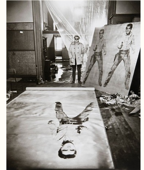
Warhol in New York studio, 1962

Warhol’s enigmatic and stubborn persona received in-depth treatment in a 2020 biography. The author spoke about his 500-page tomb and the nuance of researching the unreliable, mythic, and extremely popular artist.