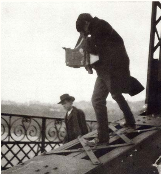
Stieglitz at work, ca. 1905

Smithsonian Magazine profiled Stieglitz in 2002 in honor of The National Gallery’s retrospective . Stieglitz was the subject of the NGA’s first exhibition dedicated exclusively to photography , in 1958.