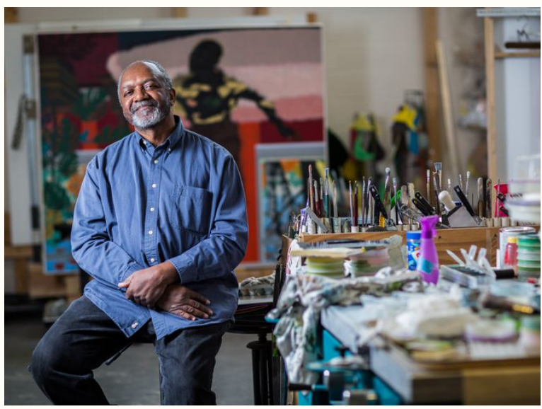
Marshall in Chicago studio, 2016

"You're not just making artworks for yourself," <u>Marshall told Art21</u> in a 2014 interview about history, racial segregation, politics, and being a black artist in an historically white system. "You're making artworks because they fit into a narrative structure that purports to define what kinds of things have value."