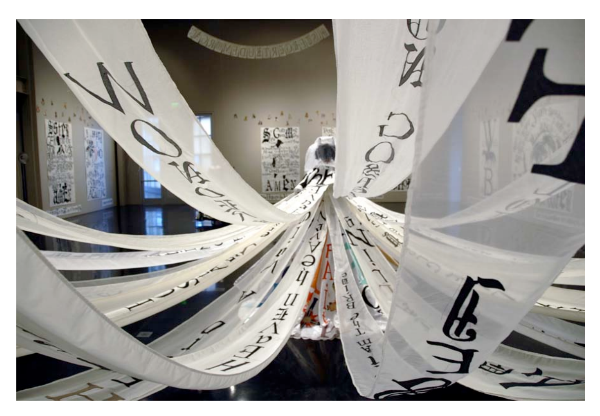
Lesley Dill (American, b. 1950), Hell Hell Hell/Heaven Heaven Heaven: Encountering Sister Gertrude and Revelation (detail), 2010. Multimedia art installation, variable dimensions. © the artist. Photograph Scott Wallin

a resource guide to using art and language in the classroom